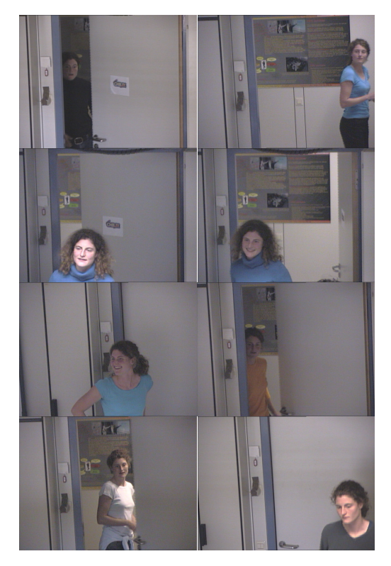
Figure 4. Sample images of an individual

Besides the images containing the faces of the individuals, the corresponding automatically detected face locations and eye centers are also available in the database. These automatically generated labels have been validated by a human, and the false detections have been corrected manually.